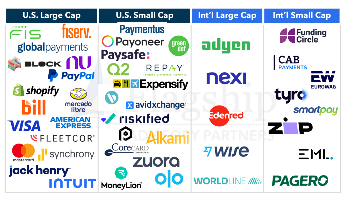
Figure 2: Sample of Listed Fintechs

Notes: Small cap refers to companies with a market capitalization generally less than $2 billion USD; Large cap refers to companies with a market capitalization generally greater than $10 billion USD (more or less, we included some close to $10B)