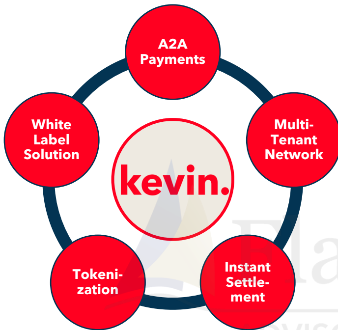
Figure 1: Product Offering and Business Model